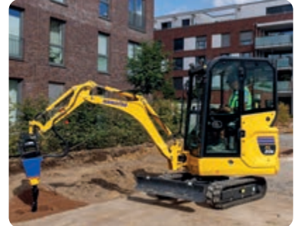
Perfect control even during combined operations