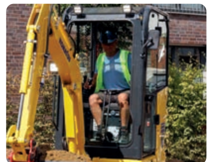
Large glass surfaces provide an excellent all-round view on the job site