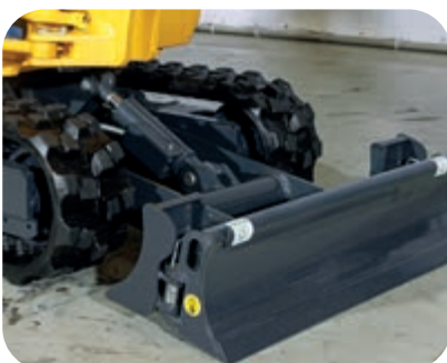
Foldable blade to match the variable undercarriage gauge