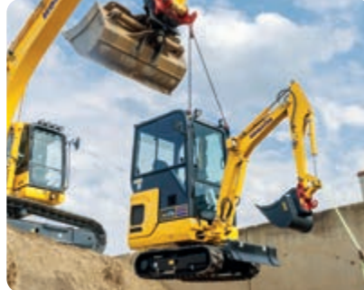
Fast and simple lifting using ropes only, without any additional tools required