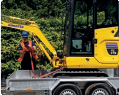
Tie down points on upper structure help to quickly secure the machine for transport