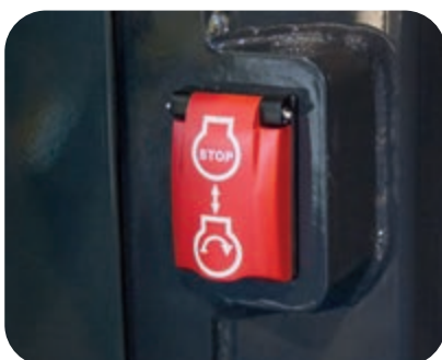
Secondary engine shutdown switch