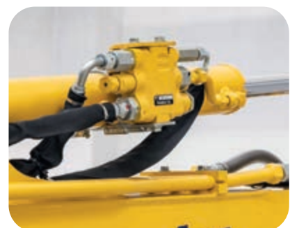
Hose burst valves on boom and arm cylinders