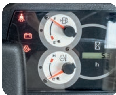
Seat belt caution indicator on the dashboard