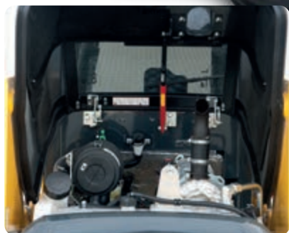
Easy access to daily maintenance points

Routine maintenance and check-ups can be performed by simply opening a rear bonnet that also allows the user to clean the inclinable radiators. For extra servicing, the tilting cab offers complete access to the transmission and to the main components of the hydraulic system. Special self-lubricating bushings increase the greasing intervals for all pins up to 250 hours.