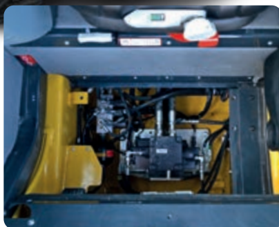
Thanks to the internal cab bonnet, extra servicing of the main valve can be done quickly without tilting the cab