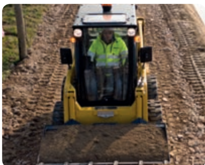
Excellent view on work equipment and job site