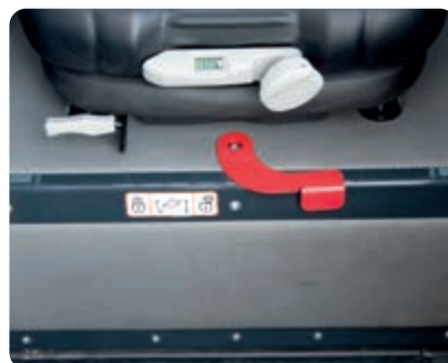
Work equipment safety lock lever