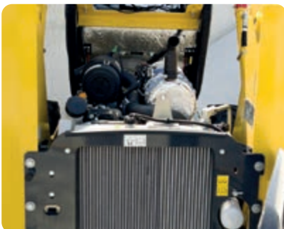
Easy access to daily maintenance points

Routine maintenance and check-ups can be performed by simply opening a rear bonnet that also allows the user to clean the inclinable radiators. For extra servicing, the tilting cab offers complete access to the transmission and to the main components of the hydraulic system. Special self-lubricating bushings increase the greasing intervals for all pins up to 250 hours.