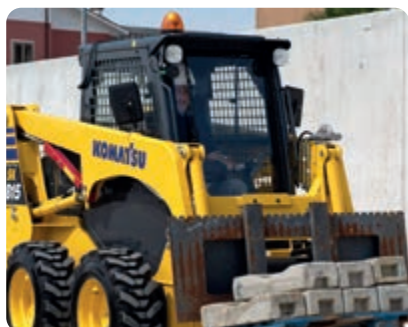
Excellent view on work equipment and job site