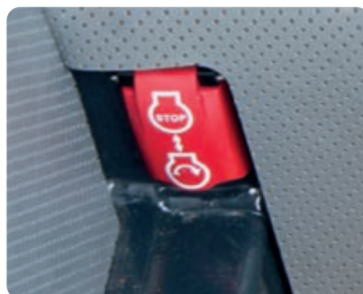
Secondary engine shutdown switch