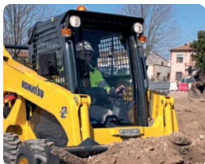
Excellent view on work equipment and job site