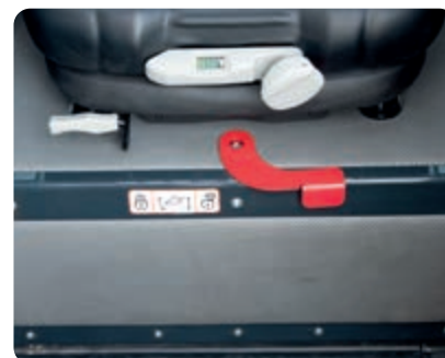
Work equipment safety lock lever