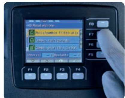
Basic maintenance screen on the 3.5" multi-colour monitor