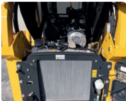
Easy access to daily maintenance points

Routine maintenance and check-ups can be performed by simply opening a rear bonnet that also allows the user to clean the inclinable radiators. For extra servicing, the tilting cab offers complete access to the transmission and to the main components of the hydraulic system. Special self-lubricating bushings increase the greasing intervals for all pins up to 250 hours.