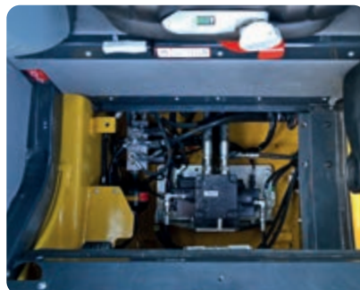
Thanks to the internal cab bonnet, extra servicing of the main valve can be done quickly without tilting the cab