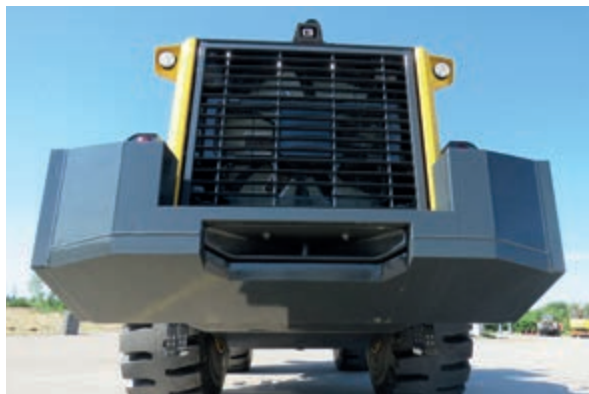
Heavy counterweight (4.975 kg)