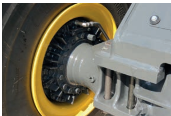
Axle oil cooling system