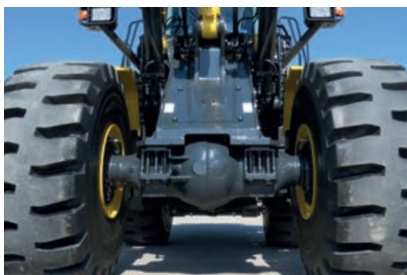
Reinforced axles and reinforced front frame