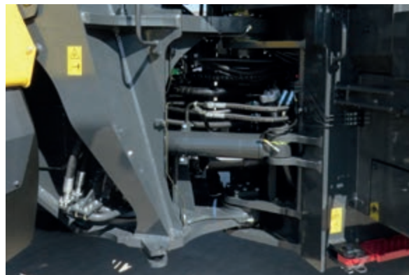
Reinforced center hinge pin, larger steering cylinders and adjusted hydraulic system