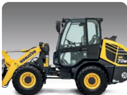
Low total height (2.48 m) for easy transport