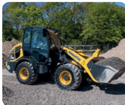
Electronically controlled suspension system load stabilizer (ECSS) (option)