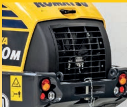
Wide core radiator with (optional) reversible fan