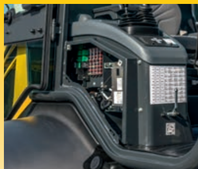
Side cover for quick maintenance access