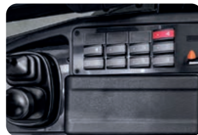
Improved, ergonomic control elements