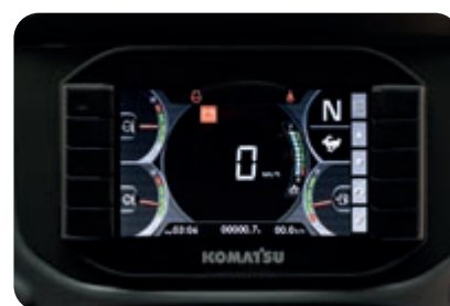
Large multi-function monitor

The user-friendly multi-function colour monitor with Equipment Management and Monitoring System (EMMS) supports safe and smooth work. Eco-gauge and an Eco guidance with active recommendations help maximising fuel savings. The monitor is conveniently customisable with a choice of 24 languages.