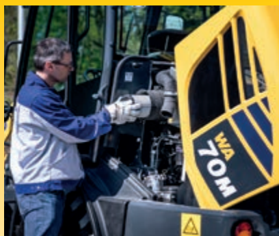
Fast, easy and comfortable access to daily inspection points