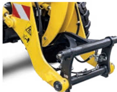
Electrically actuated quick-coupler for fast and easy change of attachments