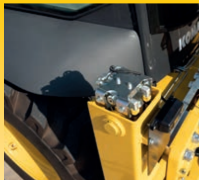
Anti-burst valves for stabilizers, boom and arm (Standard)