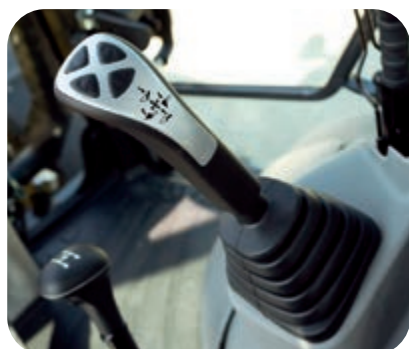
Convenient, ergonomic and precise control

A high-definition 7" LCD monitor provides excellent visibility. The high-definition LCD panel is less affected by the viewing angle and surrounding brightness, ensuring excellent visibility. Various alerts and machine information are displayed in a simple format. Useful information such as operation records, machine setting and maintenance data are also provided. The operator can easily navigate through screen pages with intuitive side buttons.