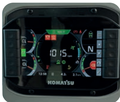
7" multi-function monitor