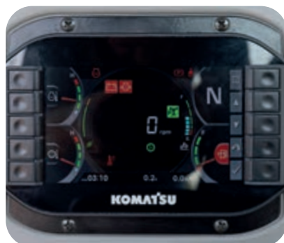
7" multi-function monitor