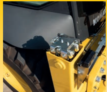
Anti-burst valves for stabilizers, boom and arm (Standard)