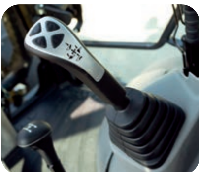
Convenient, ergonomic and precise control

A high-definition 7" LCD monitor provides excellent visibility. The high-definition LCD panel is less affected by the viewing angle and surrounding brightness, ensuring excellent visibility. Various alerts and machine information are displayed in a simple format. Useful information such as operation records, machine setting and maintenance data are also provided. The operator can easily navigate through screen pages with intuitive side buttons.